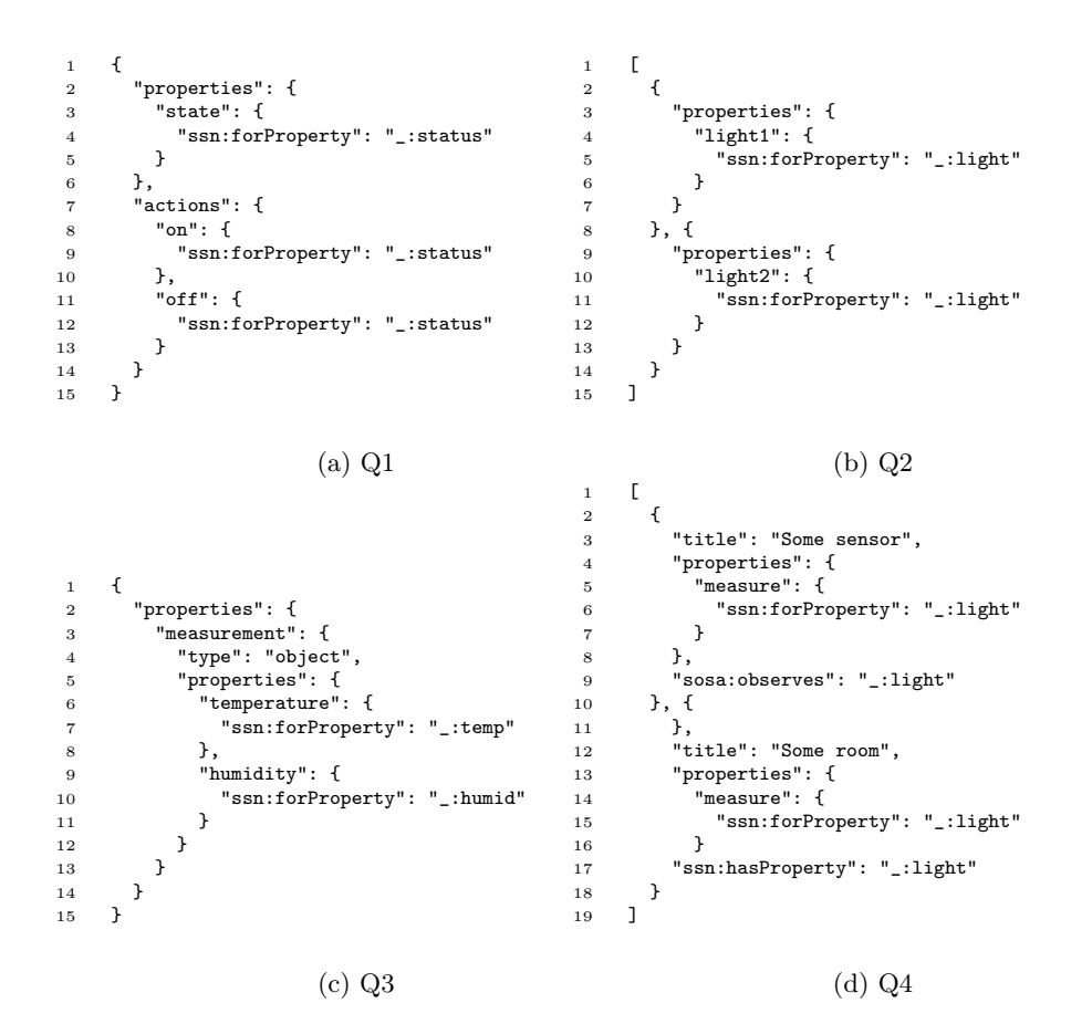
Fig. 2: Examples of annotation for each competency question

We now illustrate with examples how the competency questions of Table 1 can be addressed. In each case, the existential restrictions that exist between TD and SSN classes were "instantiated" with blank nodes that have ssn:forPropertyrelations with TD entities. Portions of TD documents can be found on Fig. 2.